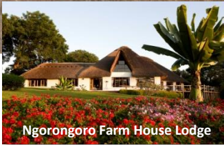
Ngorongoro Farm House Lodge